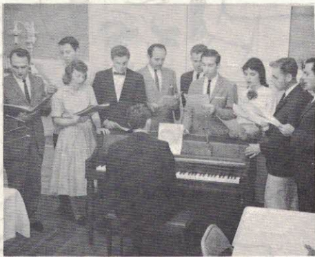
Club singing Russian songs

The insignia reads: "КОЛЛЕДЖ АМБАССАДОР" РУССКИЙ КЛУБ In English it means "Ambassador College Russian Club."